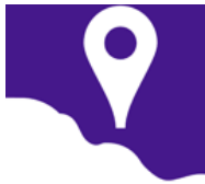
Photo Map allows Android users to mark locations on a map with photographs. Users with navigation needs can look for different photo markers on the interactive map to ease navigation skills.